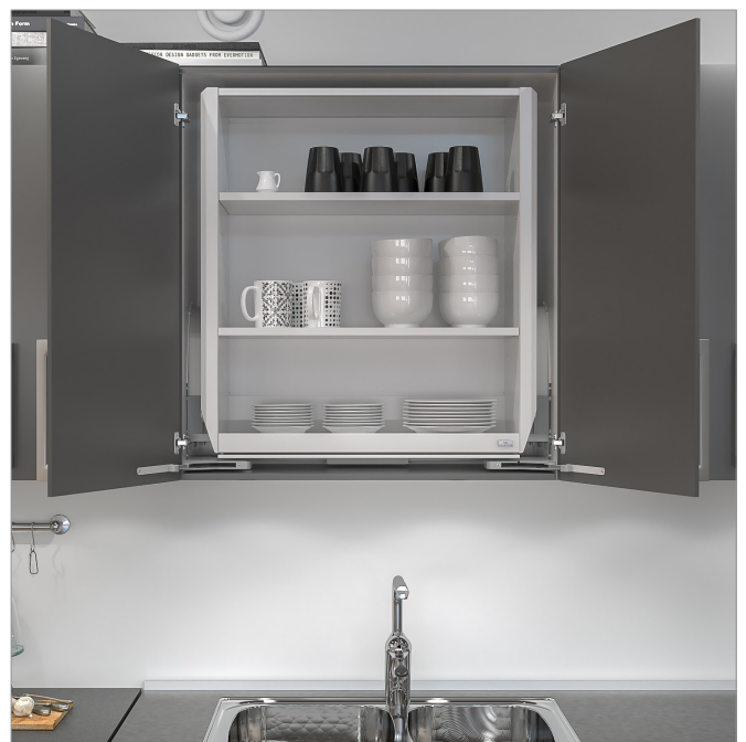
The mechanics and motors are optimally positioned so as to take up as little space as possible inside the cabinet.