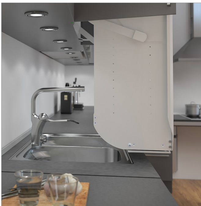
There is plenty of room for the mixer tap and other objects on the worktop when the frame is in the lowered position.